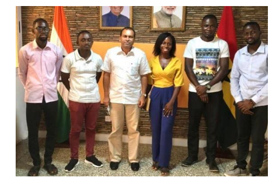
High Commissioner interacted with Indian Council for Cultural Relations Scholarship Awardees from Ghana prior to travel to India to pursue higher studies.