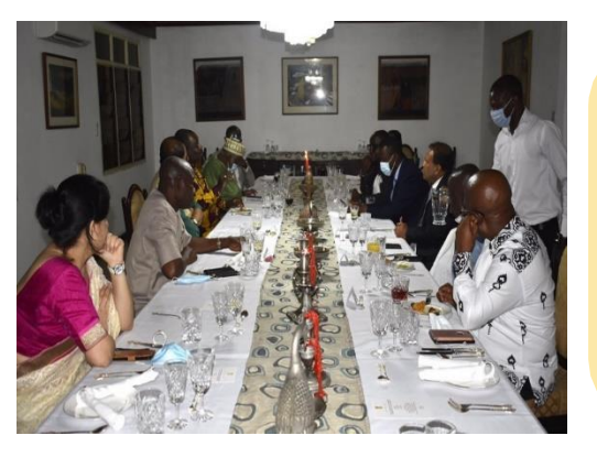
Various issues of strengthening India-Ghana relations further were discussed during call by Hon'ble Minister of State for External Affairs on newly reelected President of Ghana.