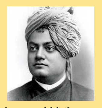
Be the servant while leading. Be unselfish. Have infinite patience, and success is yours.