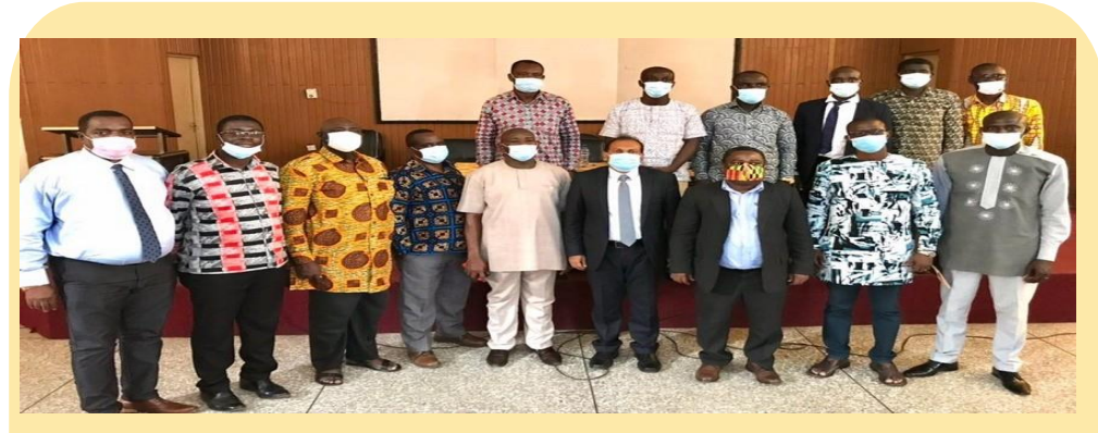
High Commissioner at Koforidua Technical University discussed possibilities to establish university to university links with India for faculty exchanges & joint research.