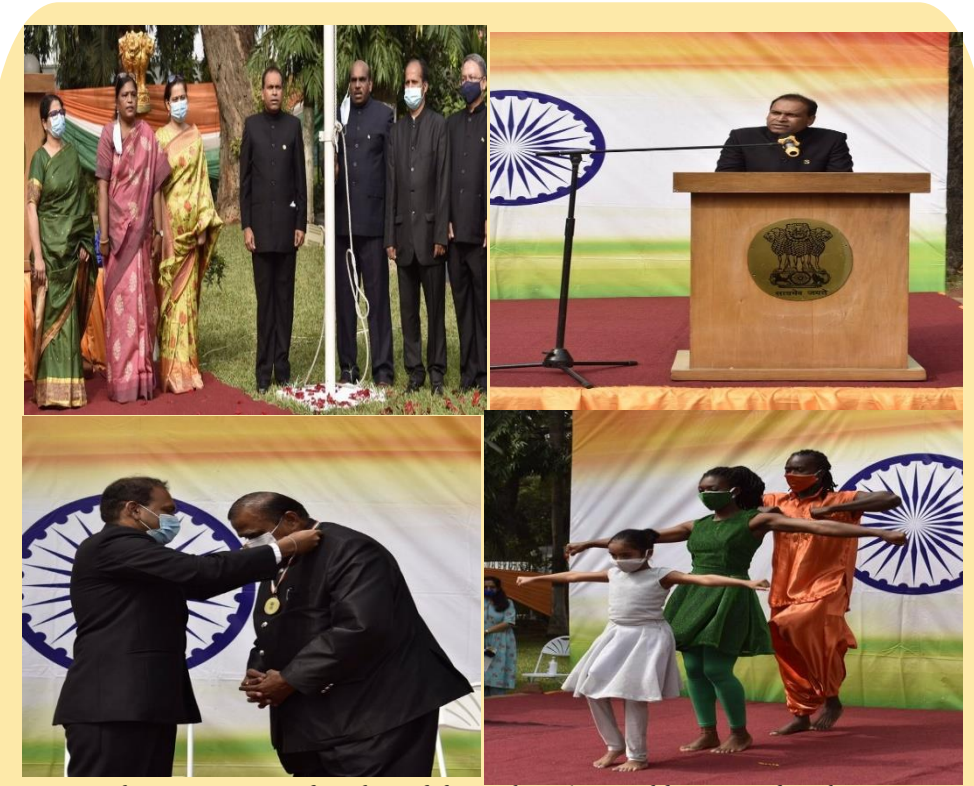
High Commission of India celebrated 72<sup>nd</sup> Republic Day of India with National Flag hoisting, High Commissioner's address, cultural performances I enthusiastic participation by the Community. High Commissioner also recognized contribution of senior diaspora members with awards.