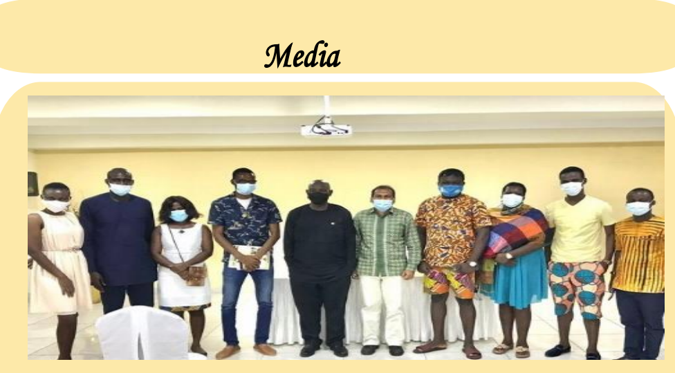
Interacting with media persons from Eastern Region of Ghana High Commissioner briefed them on developments in India especially covid vaccination drive L efforts to strengthen bilateral ties further.

→ Indian Railways has launched Freight Business Development Portal that will enhance Ease of Doing Business in India.