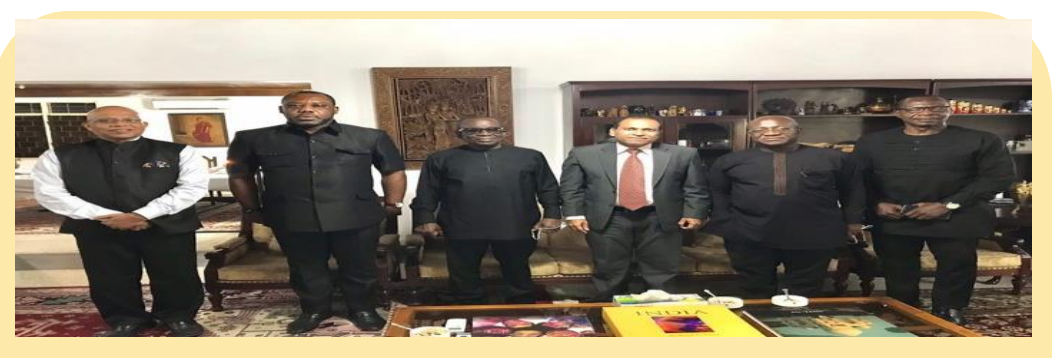
On the occasion of Republic Day of India, High Commissioner along with Ghana's National Security Minister, Parliamentary Affairs Minister & Energy Minister launched India-Ghana Dialogue