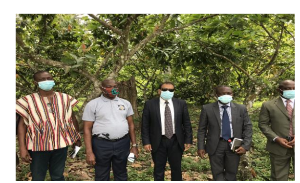
High Commissioner visited Cocoa Research Institute of Ghana, country's premier agricultural research institution, at Tafo & discussed with authorities cooperation with India in R&D and training.

Interacting with Regional Chapter of Association of Ghana Industries High Commissioner assured all support from India to businesses in Eastern Region in order to strengthen India-Ghana Economic Ties.