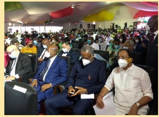
Hon'ble Minister of State for External Affairs attended the swearing in ceremony of the re-elected President of Ghana, H.E. Mr. Nana Addo Dankwa Akufo-Addo