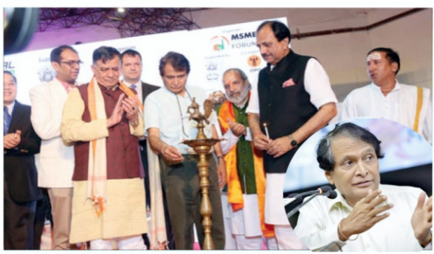
Sh. Suresh Prabhu, Union Minister of Railways, Commerce & Industry with Sh. Satish Mahana, Industry Minister, UP & Sh. Jai Bhagwan Goel Inaugurating 5th Expo